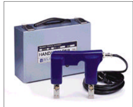
< 2 >